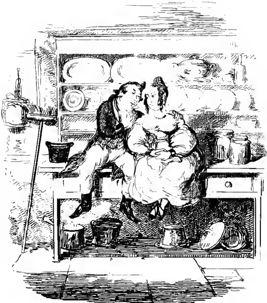
George Cruikshank —